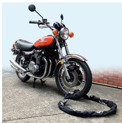
Z-1 900 SUPER 4

● Adopted one-touch lock mechanism, just inserting shaft to key cylinder allows lock.