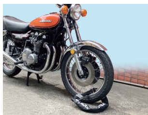
Z-1 900 SUPER 4