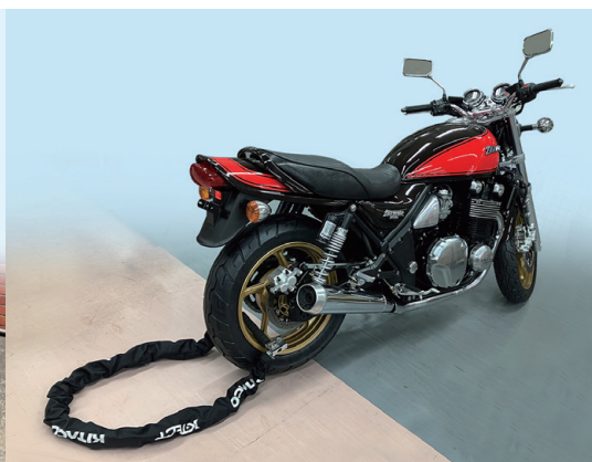
ZEPHYR 1100 (ZRT10A)

● Approximately 2.1m long, ample enough to secure tao pillar or anchor in home.